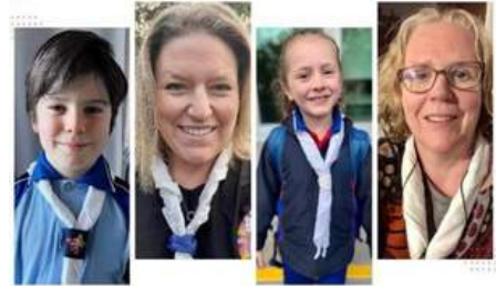
WORLD SCOUT SCARF DAY 2023

Well done also to those Joey Scouts that participated in World Scout Scarf Day on the 1st of August. It was fantastic to see so many photos of Joey Scouts and Leaders out and about proudly wearing their Scout Group scarf!