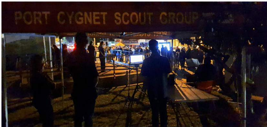
Port Cygnet Scouts present the Dawn Service to the community of Cygnet every year