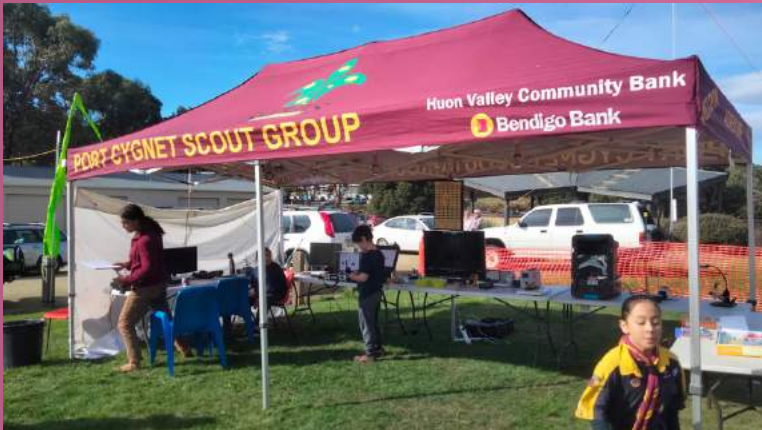
Hoon Valley Amateur Radio Hut joined in our celebrations