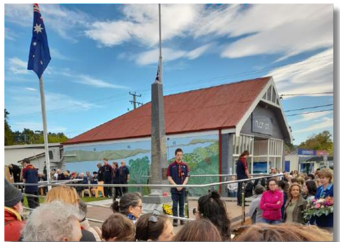
Port Cygnet Scouts lead the Cygnet march for the RSL and this year were asked to be the catafalque Party