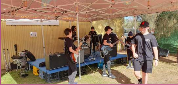
2 of our Scouts rocking it with their band 'Better Than Detention'