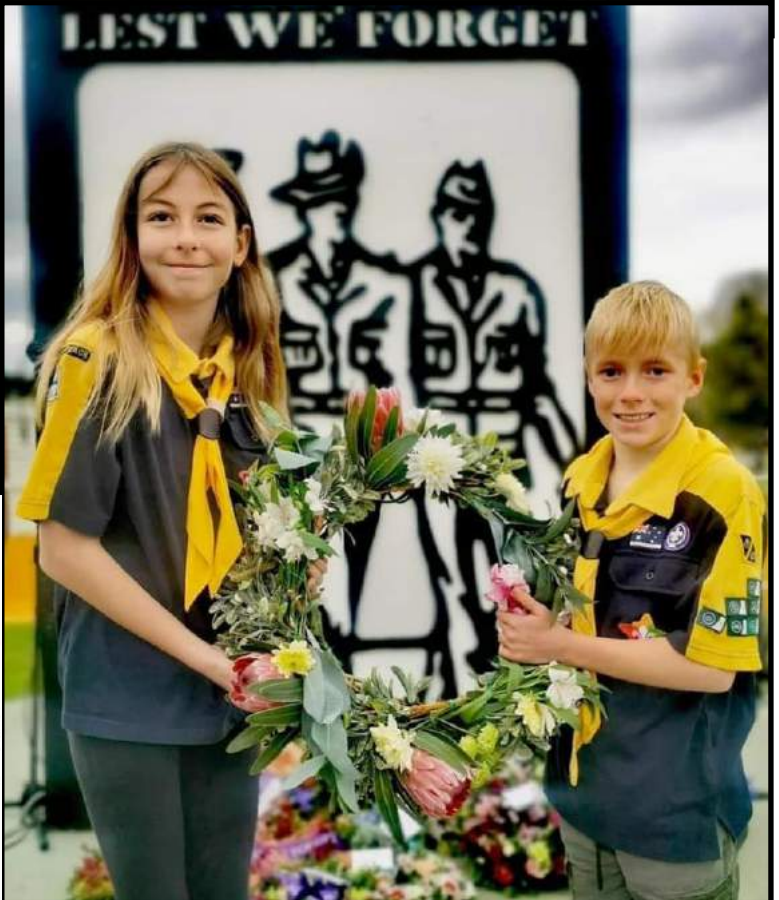
ANZAC Day Services from around the State.