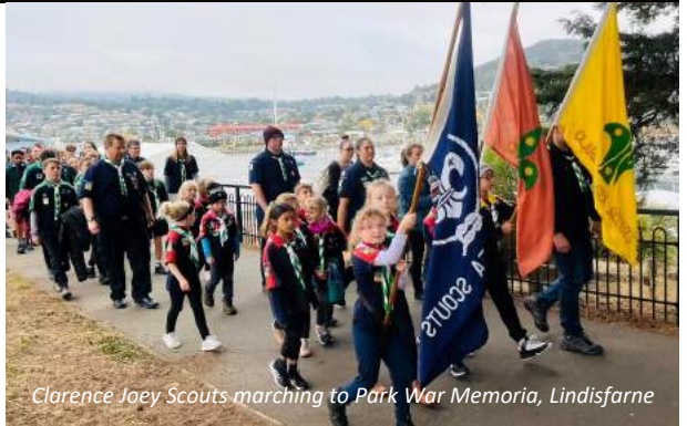
Clarence Joey Scouts marching to Park War Memoria, Lindisfarne

It may be school holidays but it has been a busy time with many Joey Scout Units enjoying bushwalks and other activities over the break. In particular, it was great to see so many Joey Scout Units involved in ANZAC Day commemorations throughout the State. It means so much to the Veterans and older members of our Community to see the involvement of our Joey Scouts at such events and it is a wonderful way to show our commitment to our Community. Well done to all those involved!