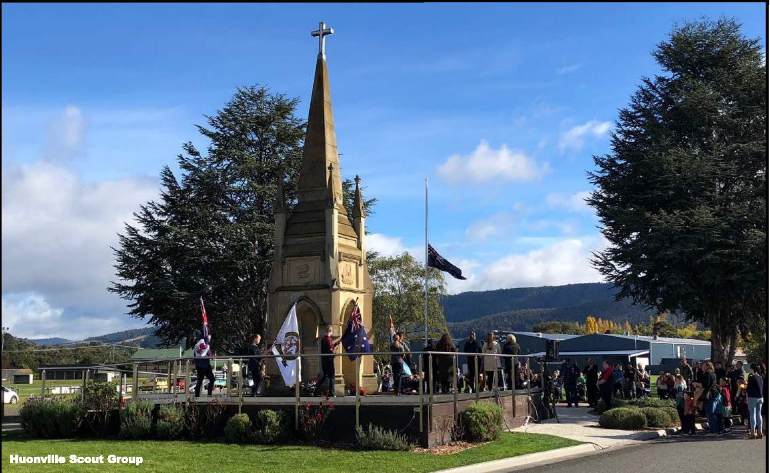
Huonville Scout Group