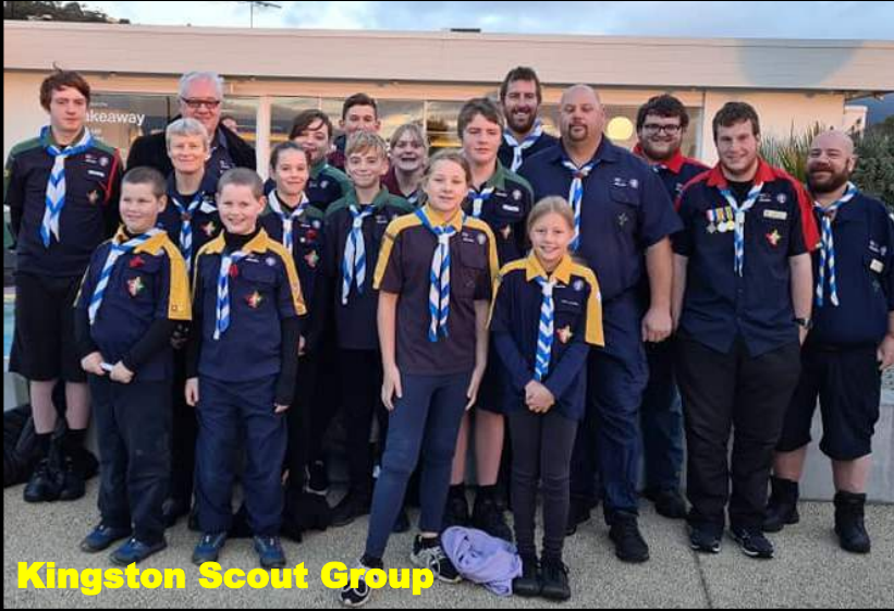
Kingston Scout Group