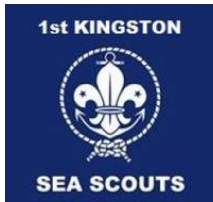
Kingston Beach & the Royal Hobart Regatta