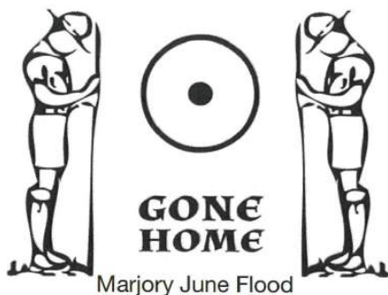
Marjory June Flood