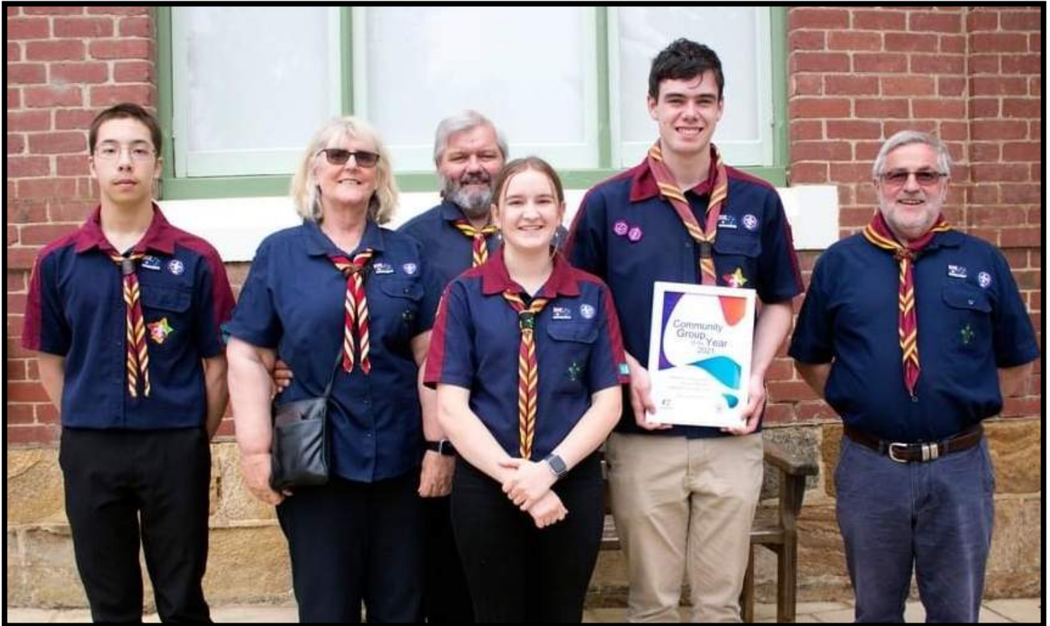
Port Cygnet Venturer Unit were awarded the Community Group of the Year in the Huon Valley 26 January 2021 Page 3