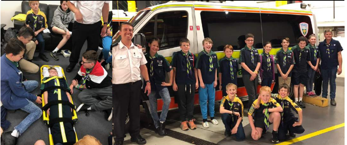
Above - Old Beach Scout Group visiting Hobart Ambulance Station Below - Rovers gather at the Annual General Meeting