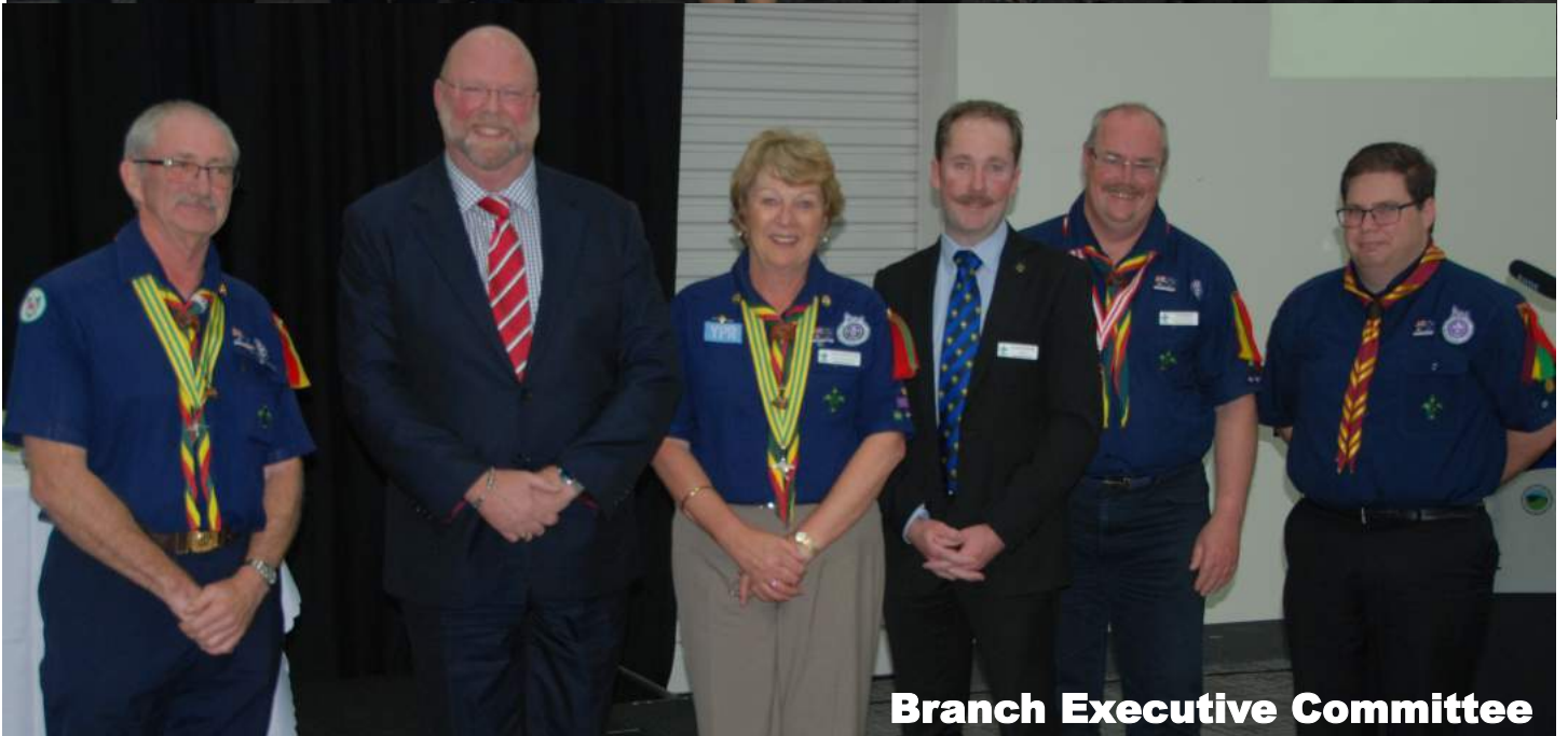
Branch Executive Committee