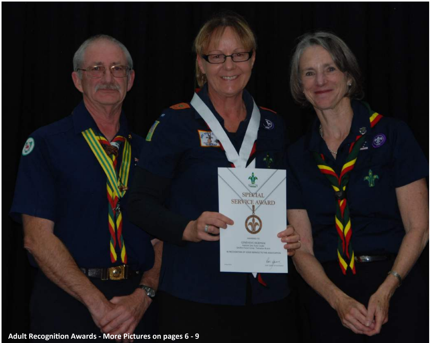
Adult Recognition Awards - More Pictures on pages 6 - 9

corey.mcgrath@tas.scouts.com.au or 0419 212 780