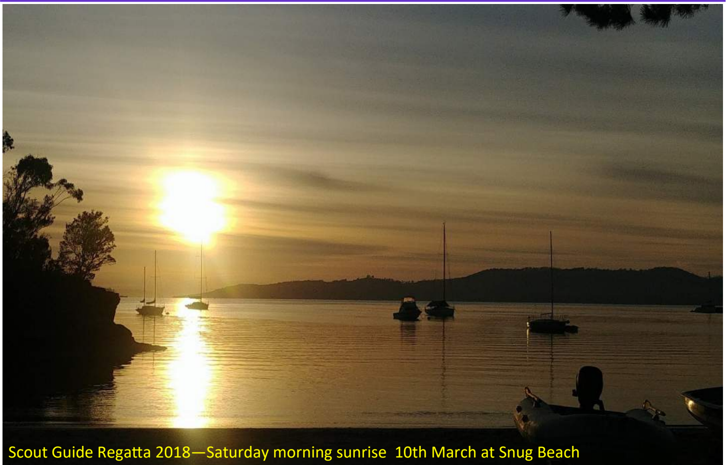
Scout Guide Regatta 2018—Saturday morning sunrise 10th March at Snug Beach