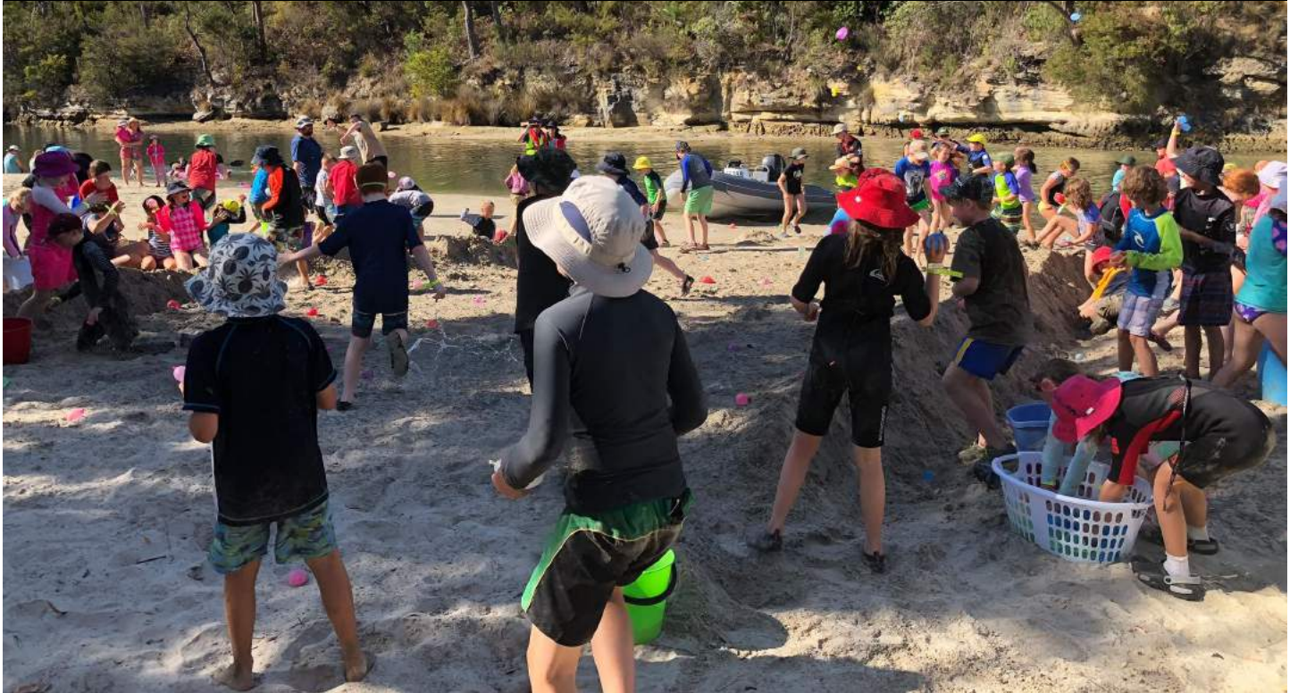
Scout Guide Regatta 2018 Snug Beach ( 10 - 12 March )