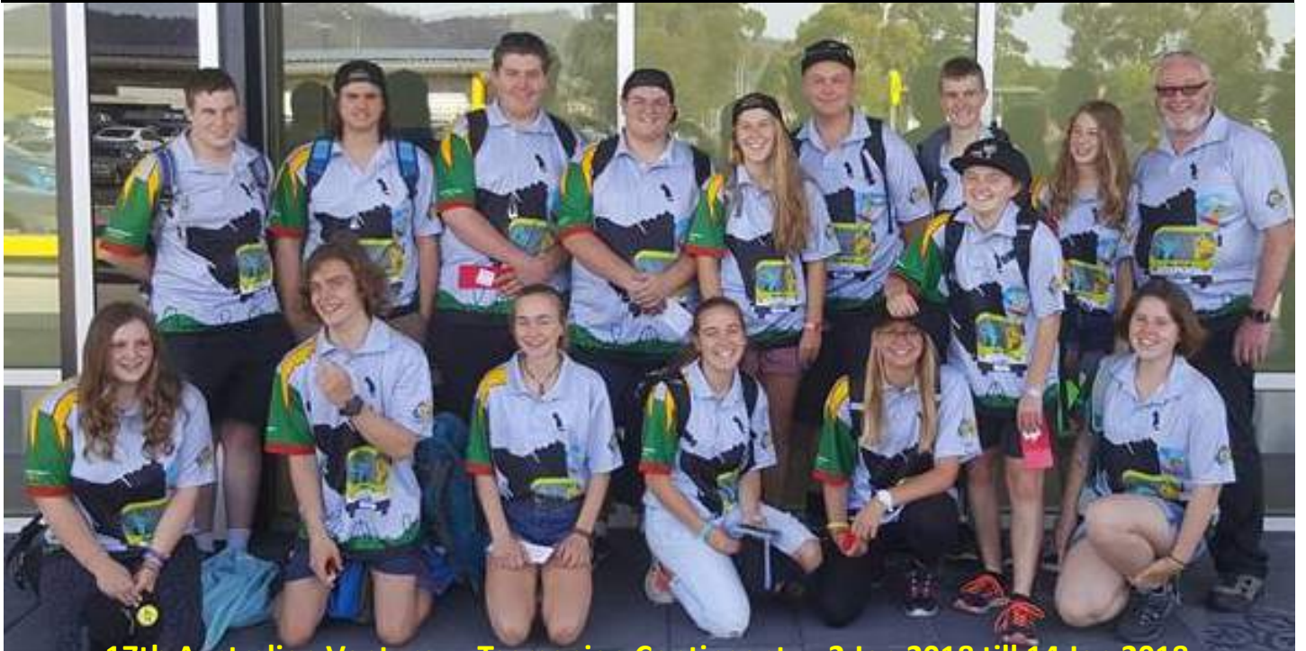
17th Australian Venture - Tasmanian Contingent - 2 Jan 2018 till 14 Jan 2018