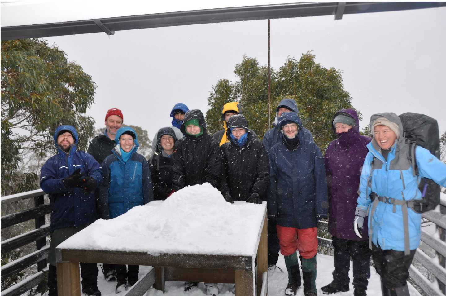
Photos of the Advanced Bushwalking Course for Leaders held at BP Lodge in Cradle Valley