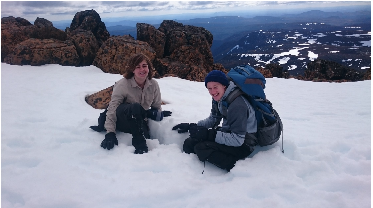
4th Launceston snow visit