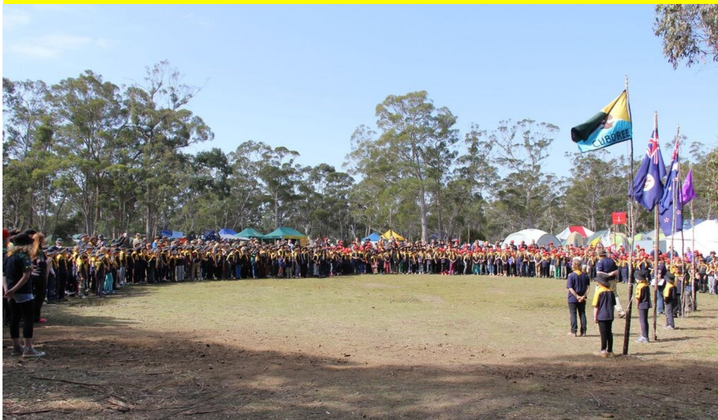
The 23rd Tasmanian Cuboree was held at The Lea 25—27 of September