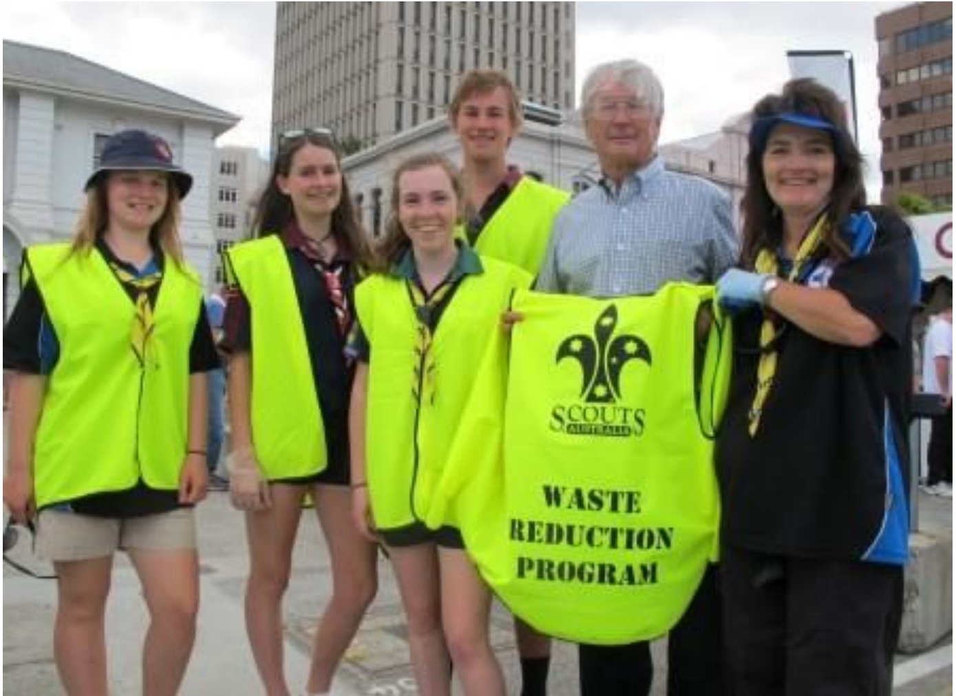
Howrah Venturers at the Wooden Boat Festival with Dick Smith.