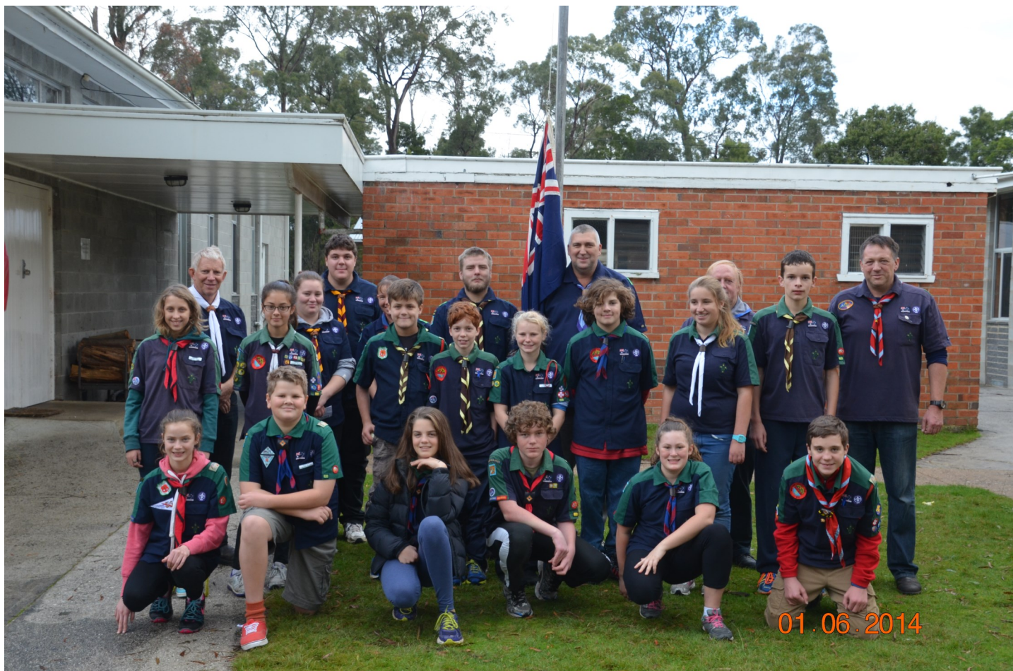
Scout Leadership Course at Carnacoo 2014