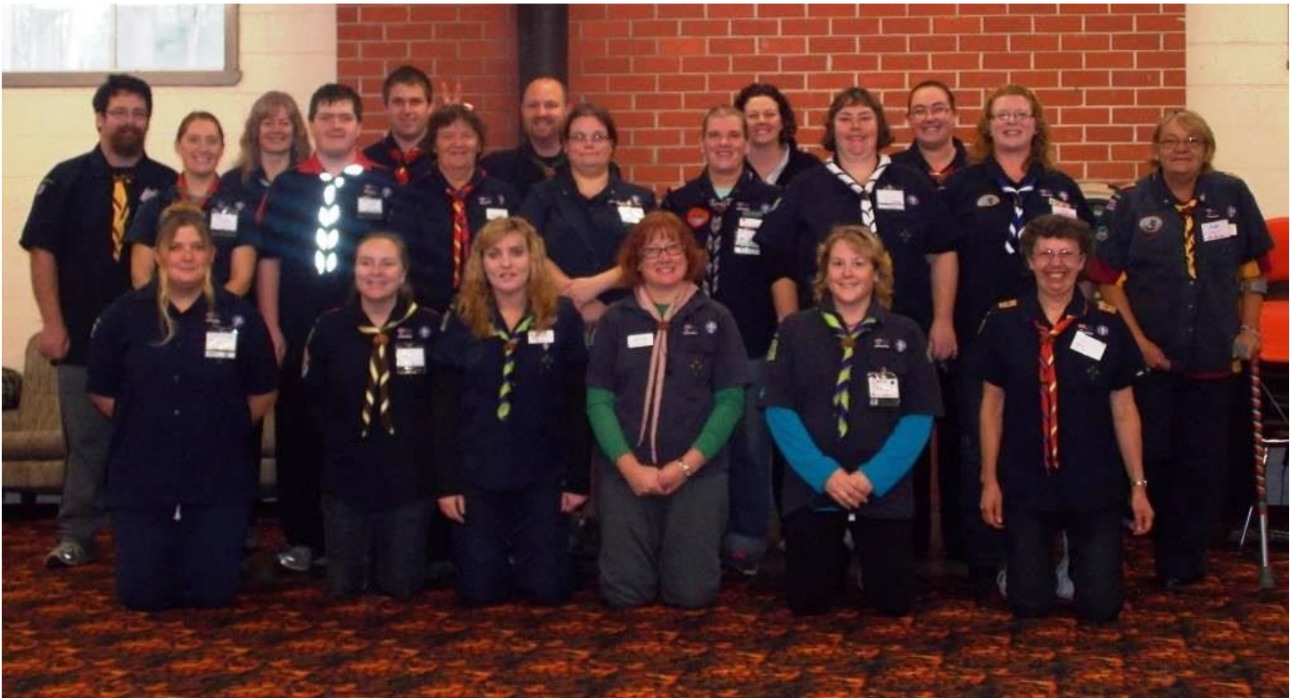
Leaders enjoying the Lenah Hop