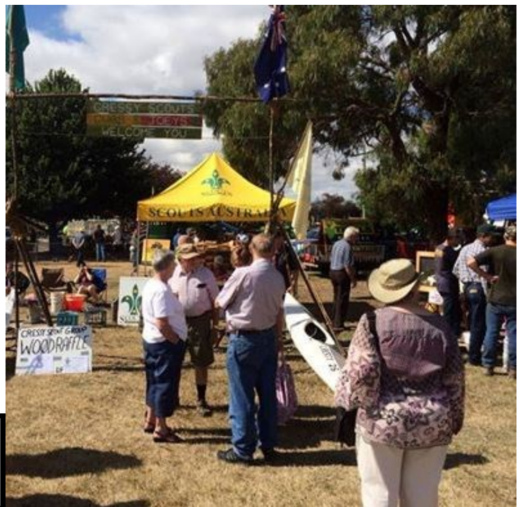
Cressy and St Helens Groups join together for the Longford Harvest Festival.