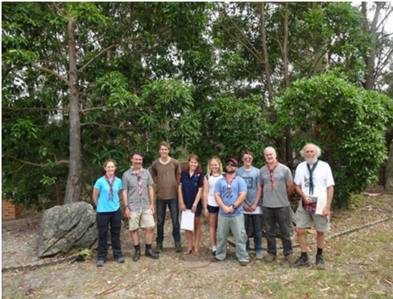
Tasmanian Contingent of Leaders and Venturers at the National Adventurous Activities School. See report page 12.