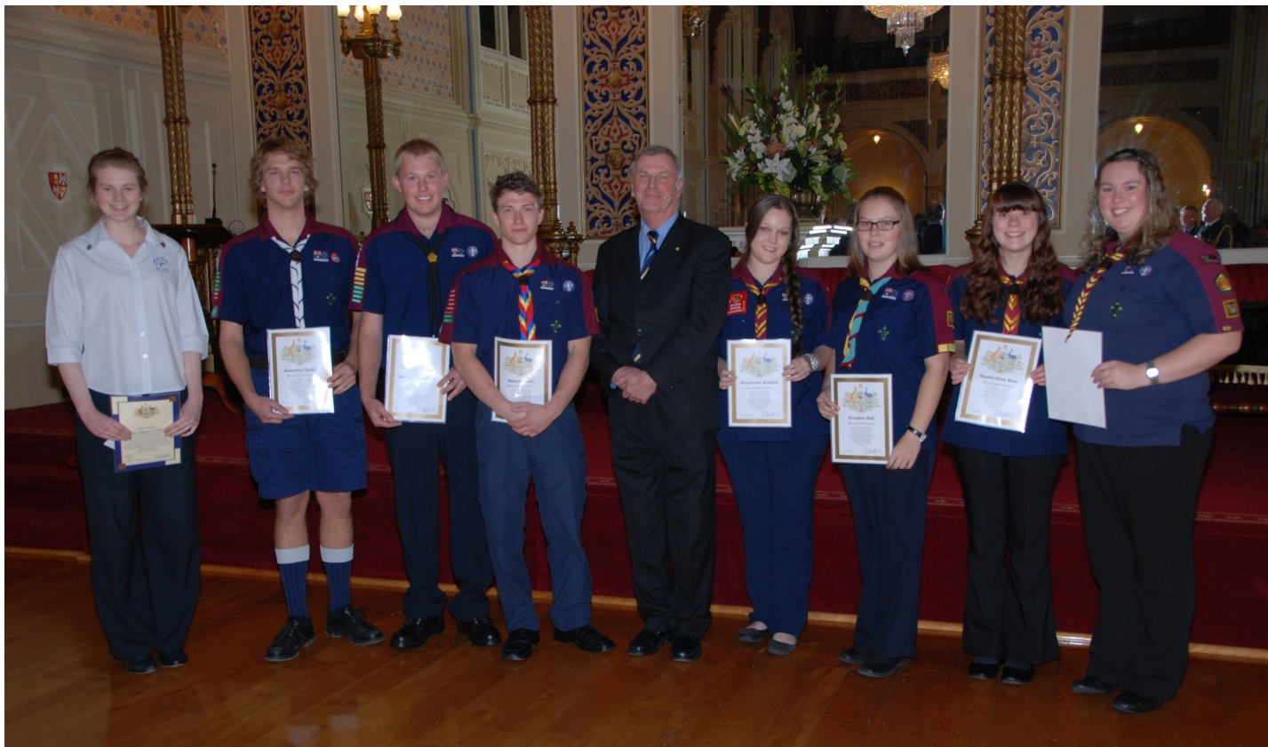
Queen Scouts & Guide presentations for 2012