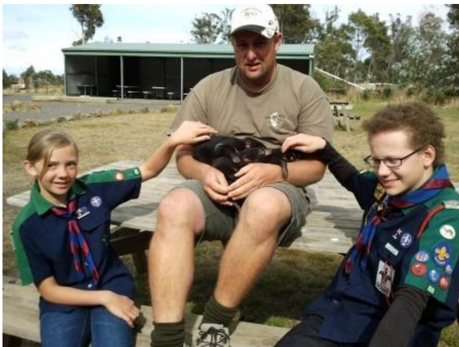
Riverside Scouts with baby devils from the insurance population