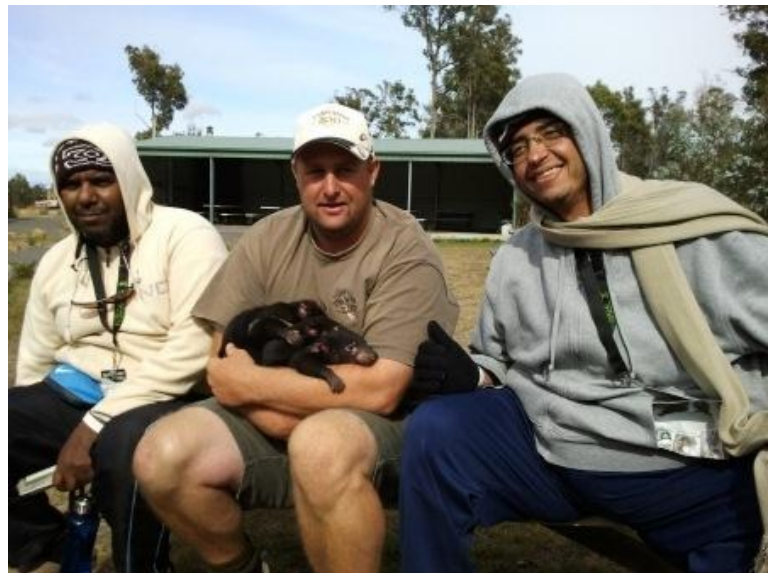
Members of the Saudi Arabian Contingent with baby devils at the Tasmania Zoo